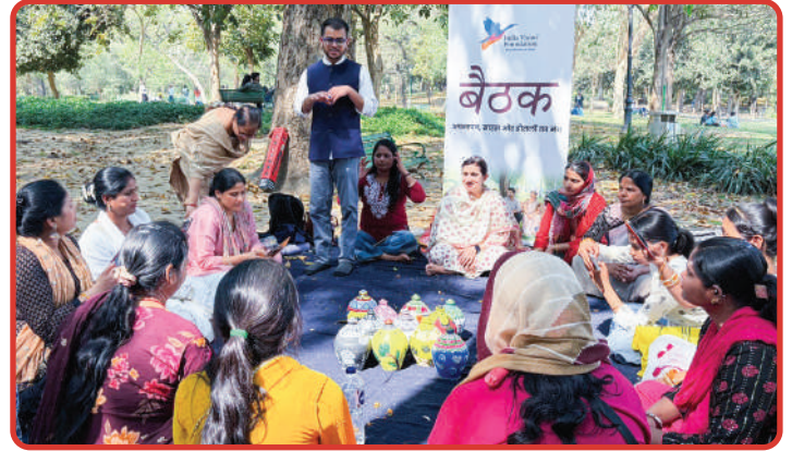
Peer support helps build confidence during transition after release

Recognizing this critical need, India Vision Foundation has launched Baithak , a community-based engagement initiative designed to reconnect with released beneficiaries and support their transition into society.