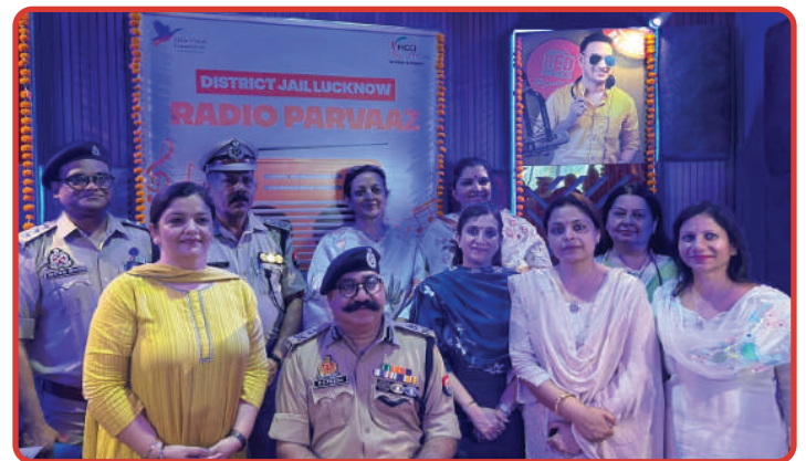
Radio Parvaaz launch at District Prison Lucknow, Uttar Pradesh