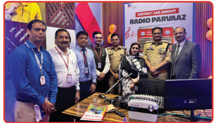
Radio Parvaaz launch at District Prison Meerut, Uttar Pradesh

Launched in 2021, Radio Parvaaz is an in prison radio platform designed to promote inmates' mental well-being, rehabilitation, and positive engagement. Through stories, music, meditation, yoga, life-skills sessions, legal awareness programmes, and motivational content, the initiative aims to reduce stress, boost morale, and create a more positive prison environment.