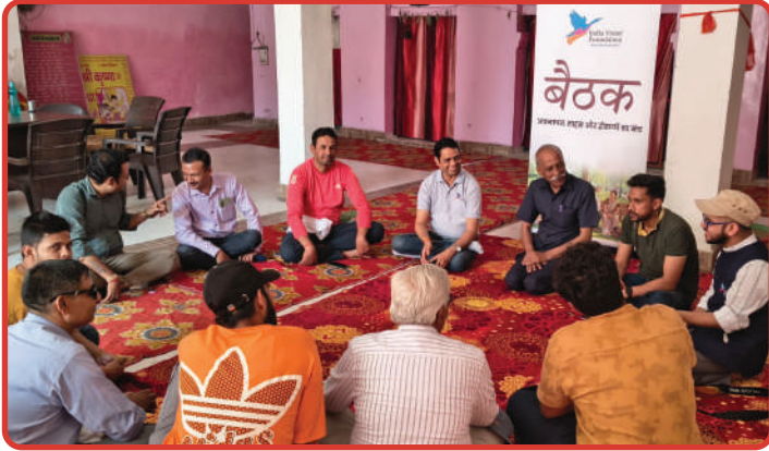
Baithak brings people together to share challenges, aspirations and progress