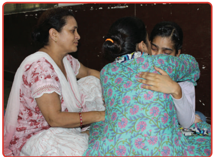
A child reconnects with her parent during the Parent- Child Meet

Parents expressed heartfelt gratitude towards the organization for continuously supporting their children's education and well-being, and resolved to work towards a crime-free and positive life upon release.