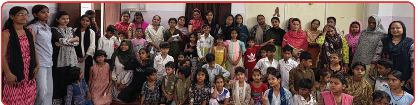
Children, caregivers and team members at the Mother's Day celebration at Bawana Community Centre