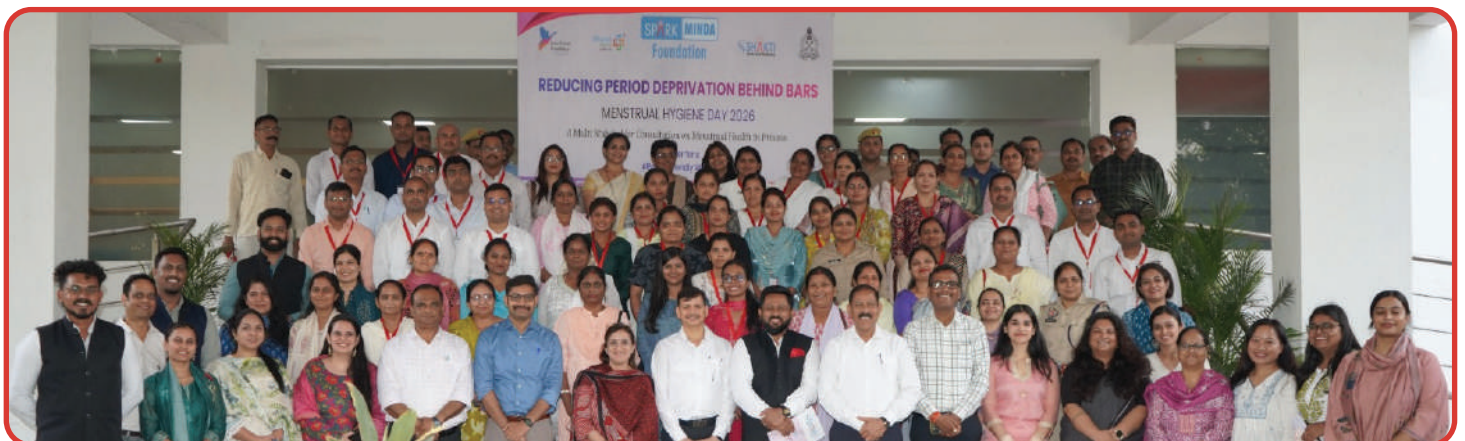
State-level consultation on menstrual health management under Project Shakti, Lucknow

Over the last two years, Project Shakti has improved awareness, access to menstrual hygiene resources, institutional sensitisation and stakeholder engagement across Uttar Pradesh Prisons.