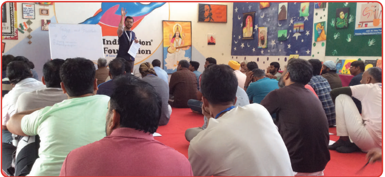
Group engagement session under the Rehabilitation and Reintegration program