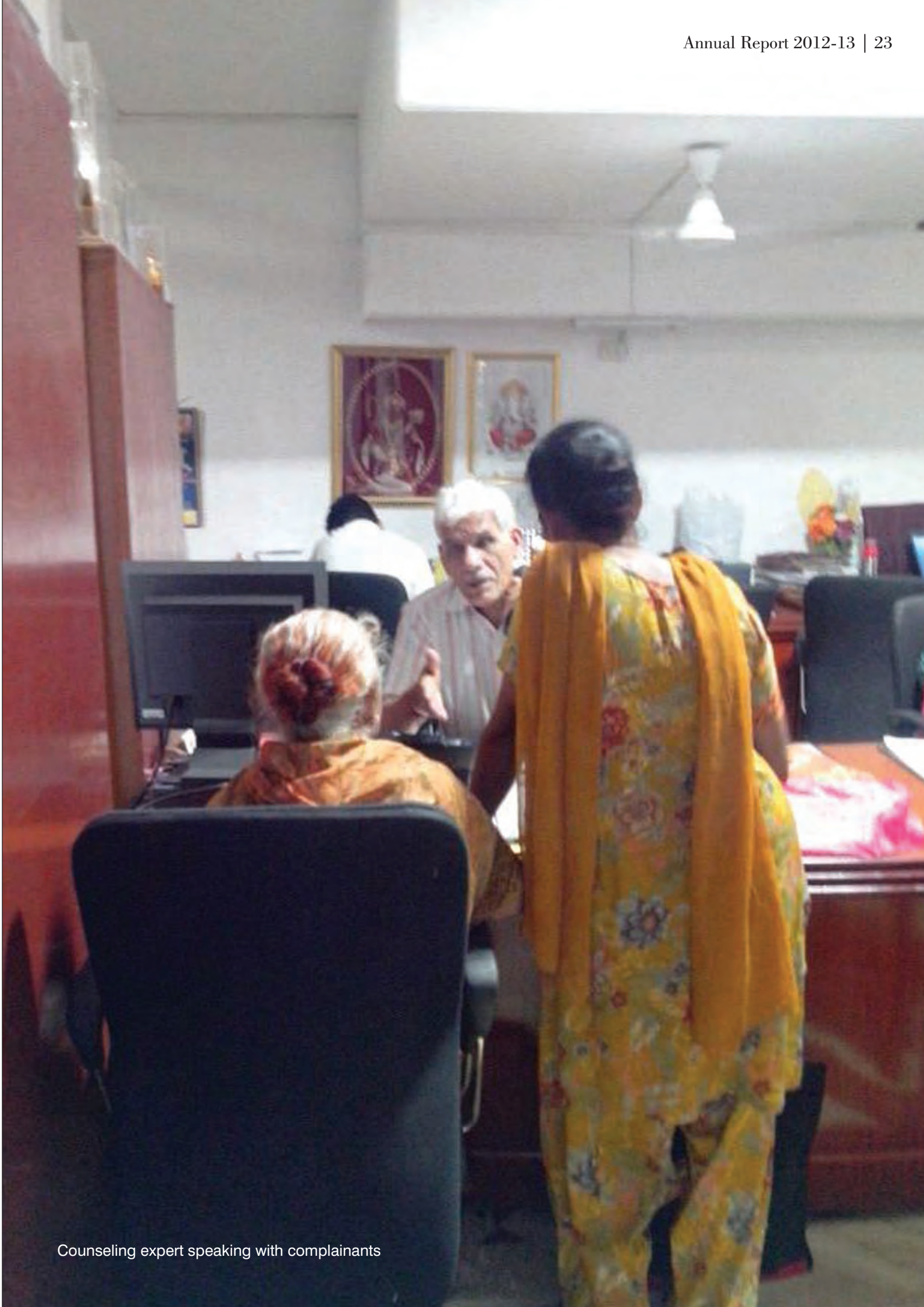
Counseling expert speaking with complainants

New associations with 3 advocates were made who agreed to support us on a pro-bono basis for the year 2012-13.