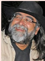
Prahlad Kakkar Creatives