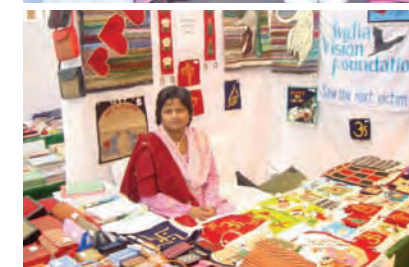
(Right) Certification distribution - Training in weaving