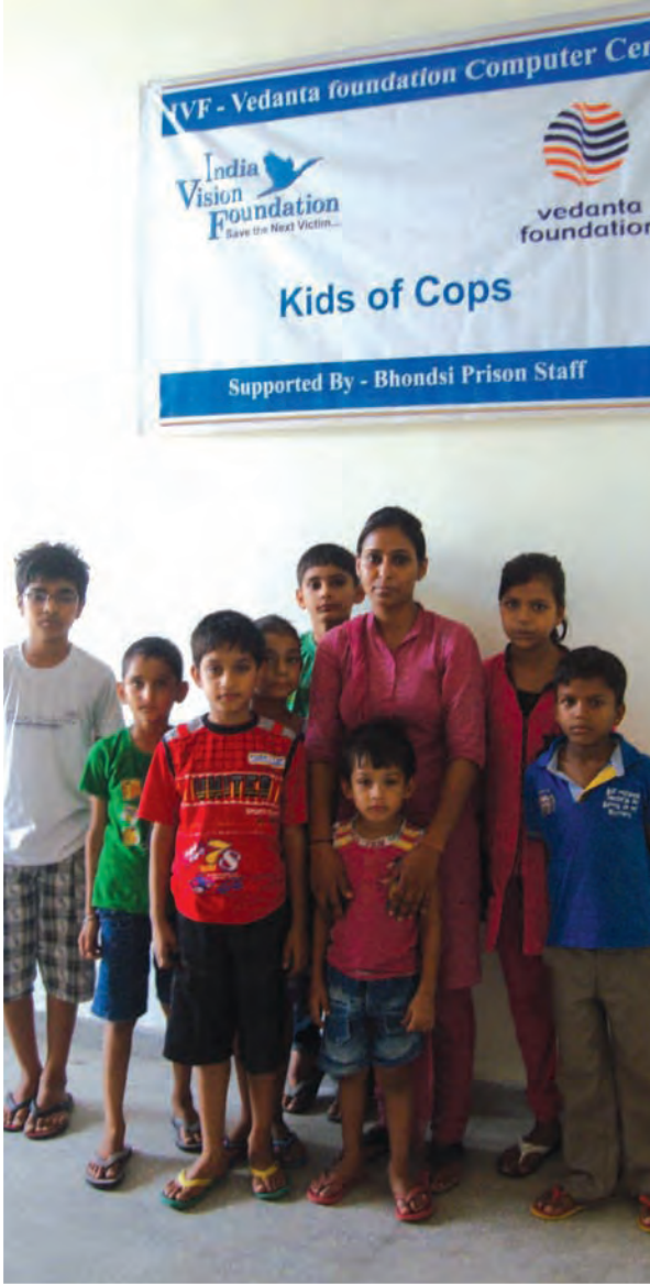
Children of the prison staff at Gurgaon India Police Center along with their trainer