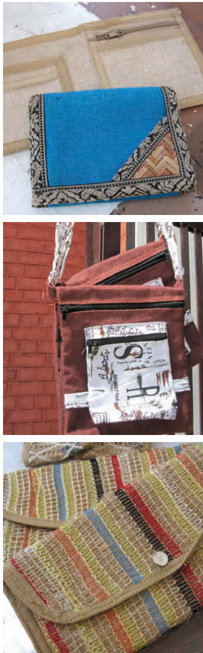
Top: Inmates trying their hand at the jute craft training machines. Right: Products created by the female inmates.