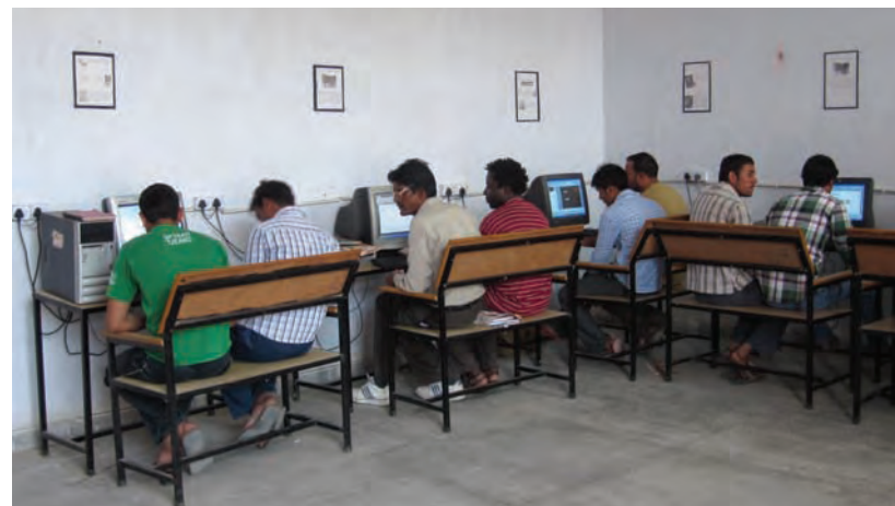
Male inmates in their IT Training centre

The inmates at the Gurgaon prisons mostly belong to rural backgrounds and with a lower literacy rate. This prison setup promises us hope and immense scope for good work that can be introduced and sustained with the male, female inmates and their children. At the outset we aimed at bringing to this prison vocational training programs and other learning workshops that would ensure the vacant hours of the inmates were filled with activities that were of interest to them and those programs that posed opportunity for them to find employment or financial independence upon their release.