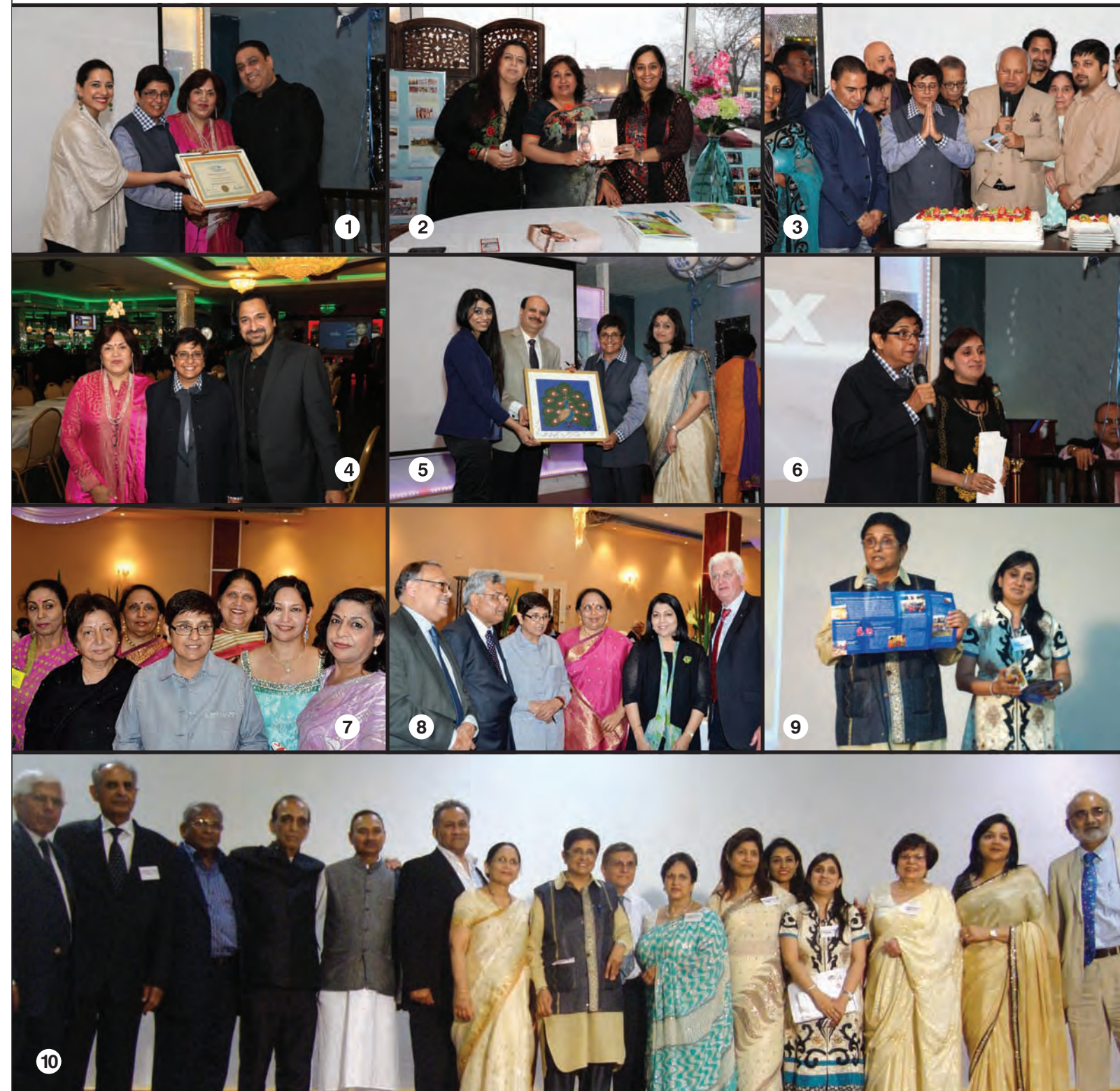
1-6 USA Event. 7-8 Australia Event. 9-10 UK Event