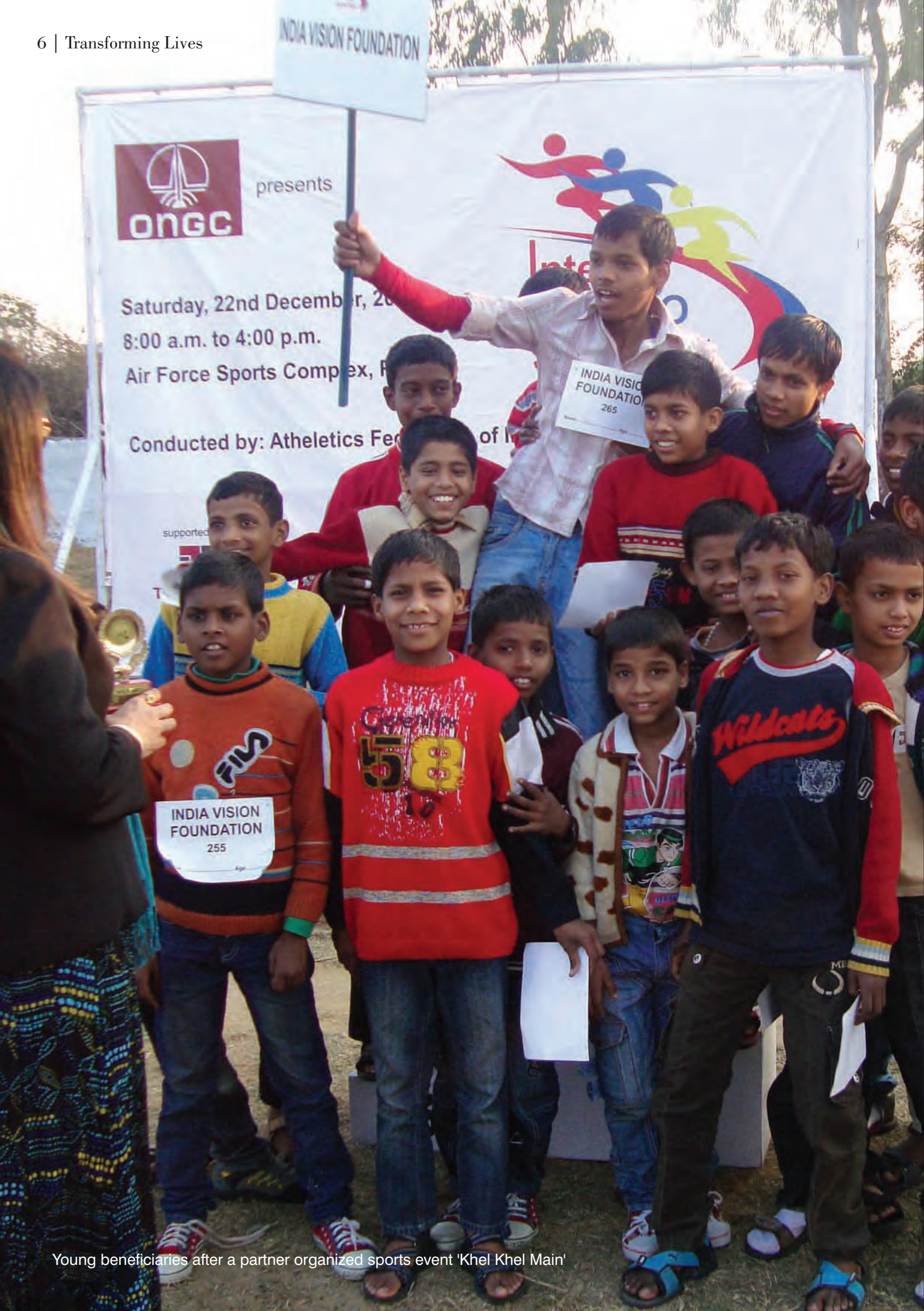
Young beneficiaries after a partner organized sports event 'Khel Khel Main'