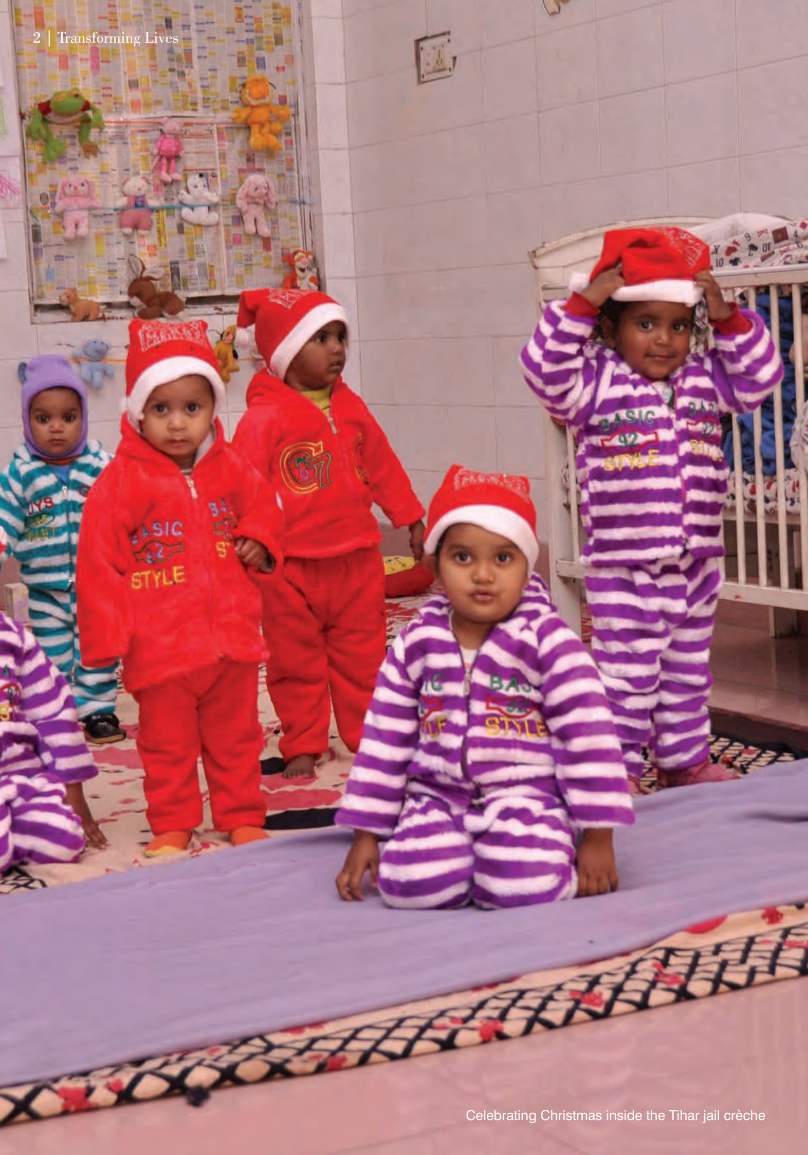
Celebrating Christmas inside the Tihar jail crèche