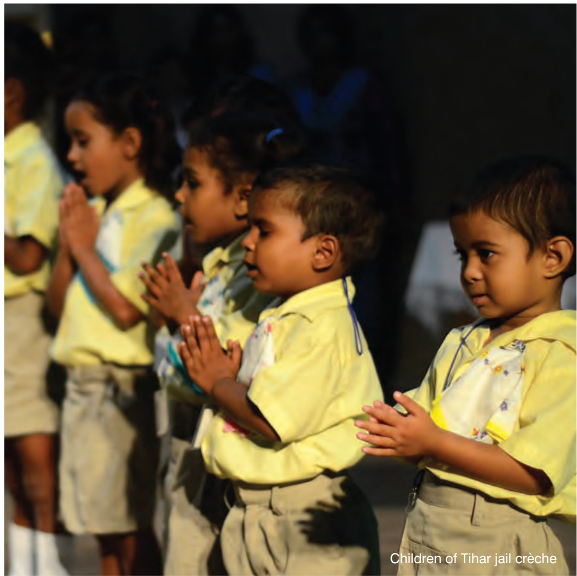
Children of Tihar jail crèche